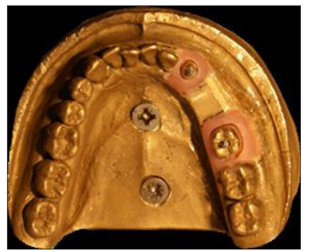
Fig. 1. Model with prepared teeth 43 and 46 gingival sulci formed brass.

the tooth, gum bleeding during impression taking, infiltration of the pocket fluid, and the amount of saliva present.<sup>9</sup> It is important to note that prosthetic restorations should be made in patients enjoying good periodontal health.